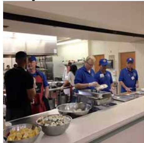
Knights man the serving line at St.. Vincent's Fish Fry on March 10th.