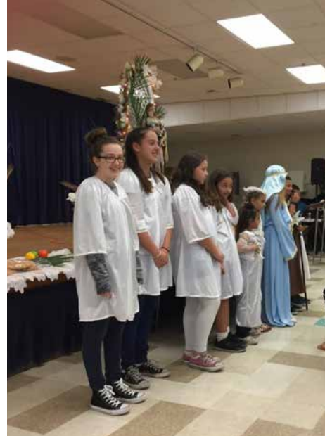
St. Joseph's Table was celebrated in conjunction with the Lenten Dinners at St.. Vincent's Hall on March 17th. Pictured above is the Holy Family visiting the dinner.